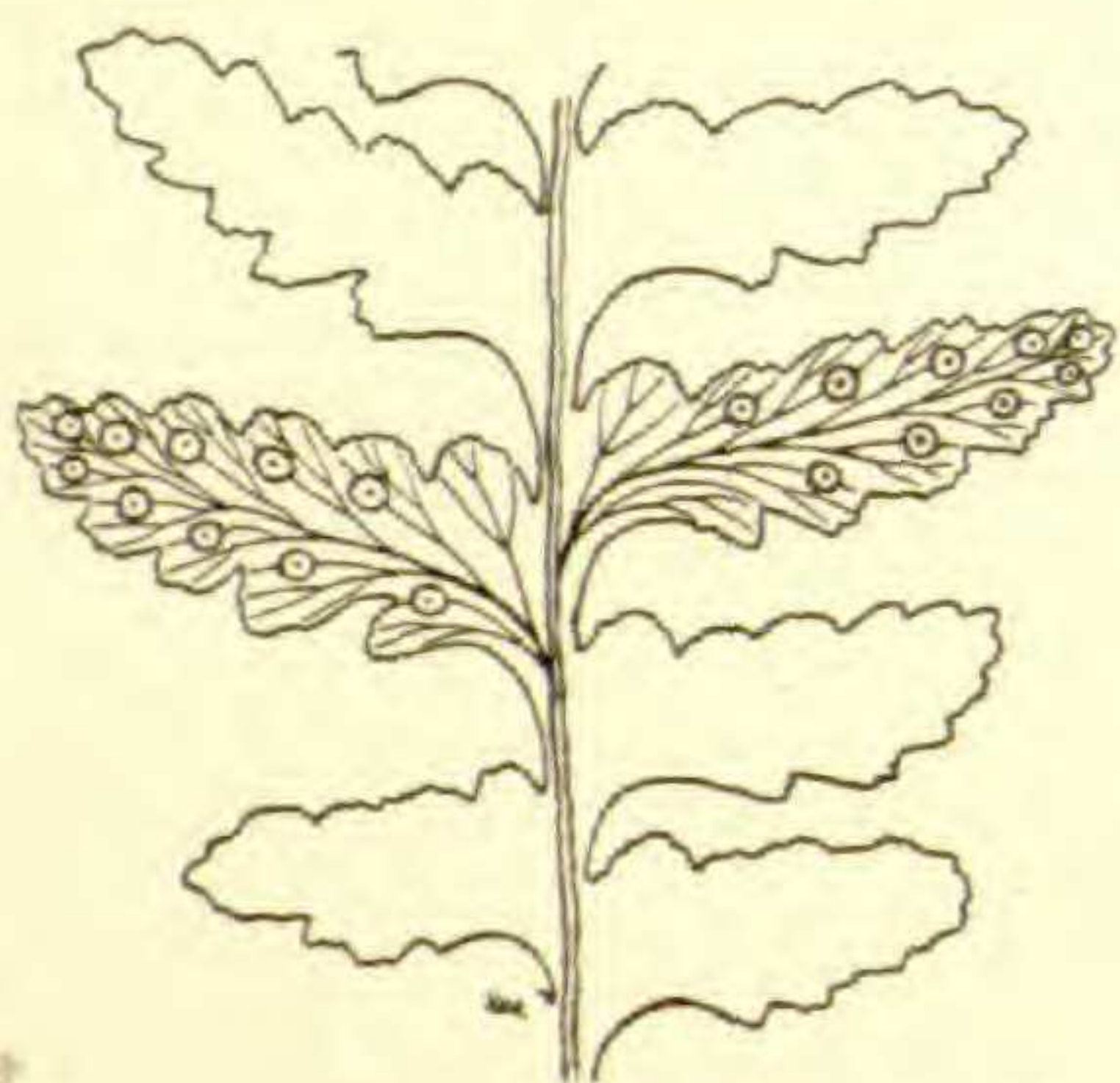
FIG. 1.— Adenoderris viscidula (Mett.) Maxon; natural size.

following characters: "Vernation fasciculate, erect, acaulose. Fronds 6 to 8 inches in length, oblong, lanceolate, pinnatifid, densely covered with pilose glands, decurrently attenuated to a short stipe. Veins pinnately forked. Receptacles punctiform, medial. Sori round. Indusium orbicular, occasionally reniform." 8 In habit the plant was said to be "totally at